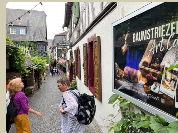
Pasadena delegation visits Ludwigshafen, Germany for its 75th anniversary as a Sister City in 2023.