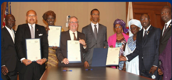
Signing the Sister City agreement between Pasadena and Dakar-Plateau, Senegal in 2019.